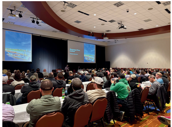
The 12 th Annual QC Stormwater Conference’s main conference room.

The conference concluded with attendees enjoying a lively networking reception featuring live music, a beer tasting, and a fun raffle prize drawing, creating a perfect blend of learning, networking, and entertainment. In partnership with Bent River Brewing Company, the committee even debuted three custom beers: an IPA, a blonde ale, and an oatmeal stout. They were brewed for the conference and featured exclusive QC Stormwater Conference labels, adding a memorable and local touch to the conference.