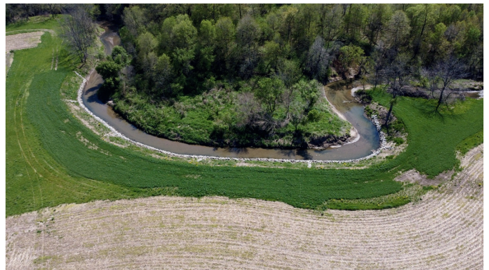
A completed streambank stabilization project in Rock Island County on Copperas Creek.