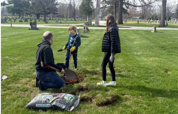
A Rock Island County 4-H family planting an oak tree in Memorial Park Cemetery in Moline, IL.

This is the fifth year in a row that Rock Island County SWCD has been selected to participate in the tree planting program. RISWCD partnered with Illinois Extension 4-H and the City of Moline to plant 25 oak trees in Moline's Memorial Park Cemetery. We had many 4-H kids and families who participated in the tree planting.