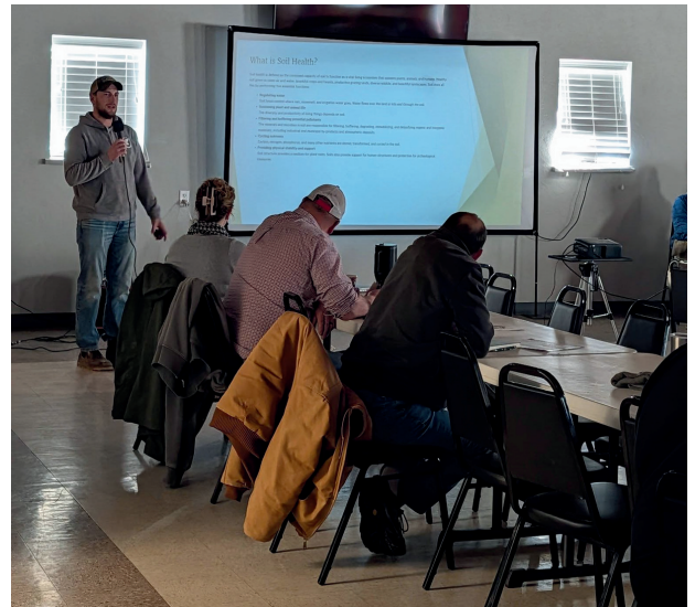
An AgriBio representative giving a presentation at the Tri-County Winter Conservation Workshop.