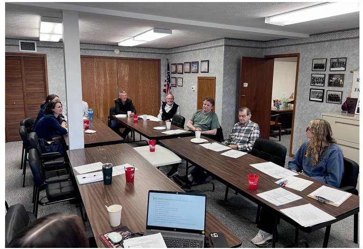
The 2026 Local Work Group meeting at the Rock Island County Farm Bureau building.