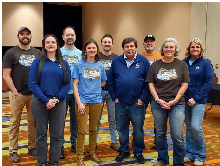
The QC Stormwater Conference Planning Committee at the 12 th Annual QC Stormwater Conference.