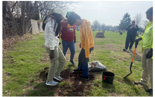
Rock Island County 4-H kids planting an oak tree in Memorial Park Cemetery in Moline, IL.

Illinois Extension 4-H and the AISWCD Forestry Committee partnered once again for a fifth year of statewide tree plantings for the Spring of 2026. This effort utilizes the strengths of the statewide network of Illinois Soil and Water Conservation Districts and the educational and youth development of University of Illinois Extension programs to create an oak recovery and tree planting educational program.