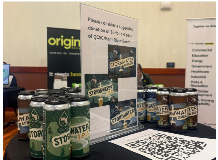
The 12 th Annual QC Stormwater Conference beer from Bent River Brewing Company.