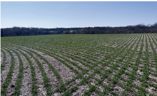
Cover crops on an agricultural field in Rock Island County.